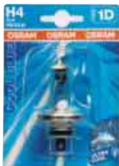
COOL BLUE®-lamps also available for parking lights.

“My father’s new car has xenon-headlamps. They’re fantastic! I also find their blue-white light much easier on the eyes. Unfortunately, my car can’t be retrofitted with them, so I tried the new OSRAM COOL BLUE®-lamps and they are the perfect visual fit for my car. Their light is very bright and very blue – almost like a xenon-lamp.”